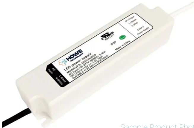
Sample Product Photo

This 30W LED Driver operates at a high efficiency range. Key protective measures allow for safe use in home, hotel, restaurant, and other public lighting applications. Install with commercial lighting such as spot, panel, wall wash, down light, etc.