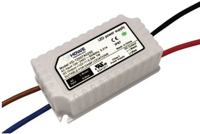
Sample Product Photo

The 7W LED Driver allows for safe use in home, hotel, restaurant, and other public lighting applications. Install with commercial lighting such as spot, panel, wall wash, down light, etc.