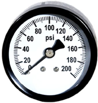
Sample Product Photo

Our line of general service gauges provide an affordable and versatile option for use in non-corrosive environments such as air, gas, oil, and water. This 2" gauge comes in a variety of pressure ranges and connection types to suit a wide field of applications.